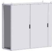
HFMDT - 2DR